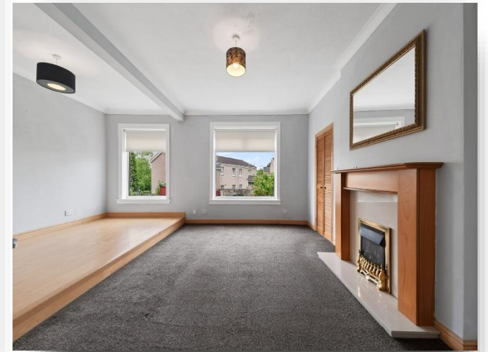
Curtis Avenue, Glasgow G44 4NN