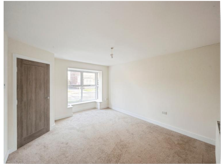
Robin Hood Grove, Thorne Doncaster DN8 4FH