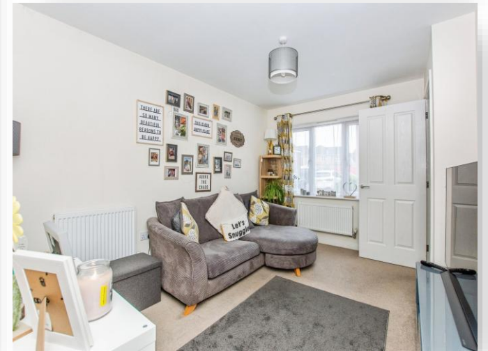
Grove Gardens, Elm Wisbech PE14 0JQ