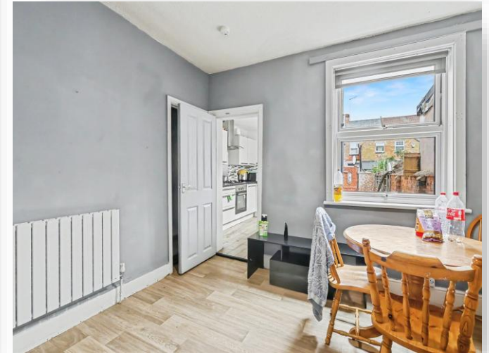
Argyle Street, Northampton NN5 5LJ