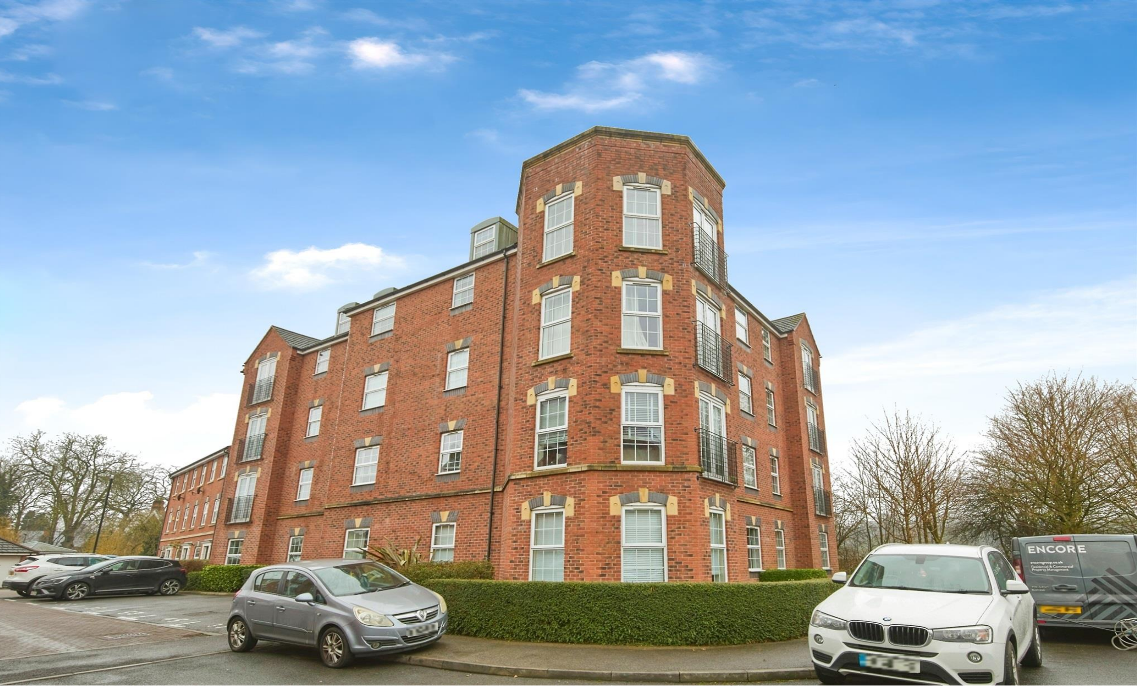
Magnus Court, Derby, DE21 4TQ