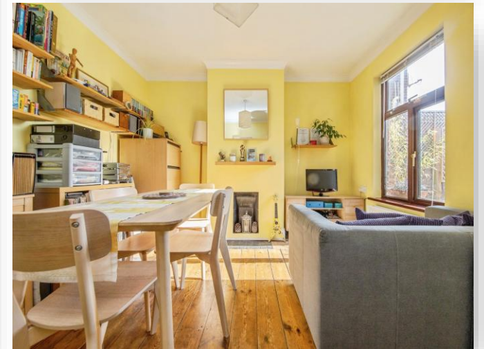
Martin Road, Ipswich, IP2 8BJ