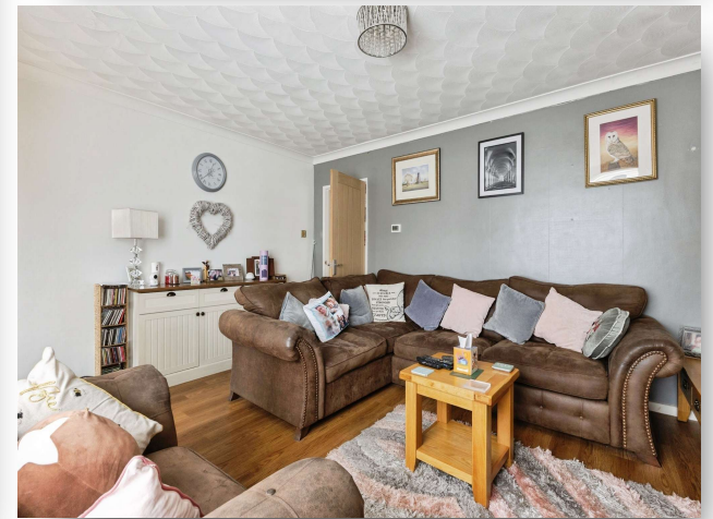
Gowing Road, Norwich NR6 6UL