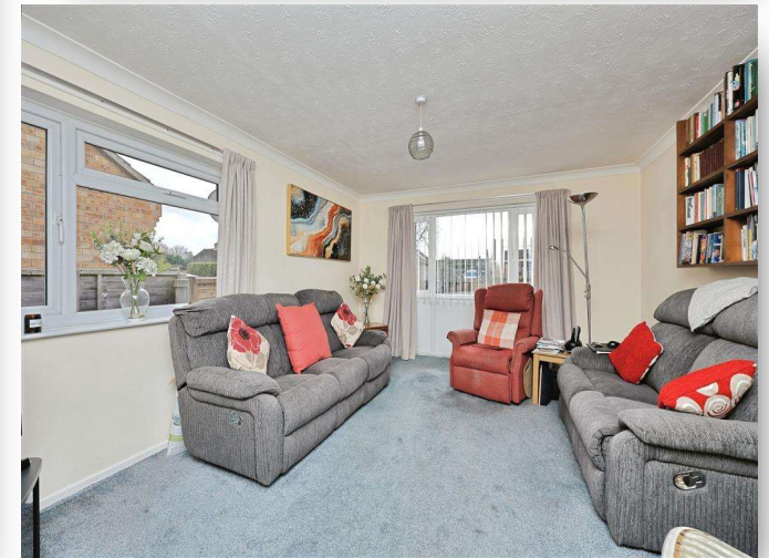
Lime Tree Close, Mattishall, Dereham, NR20 3PP