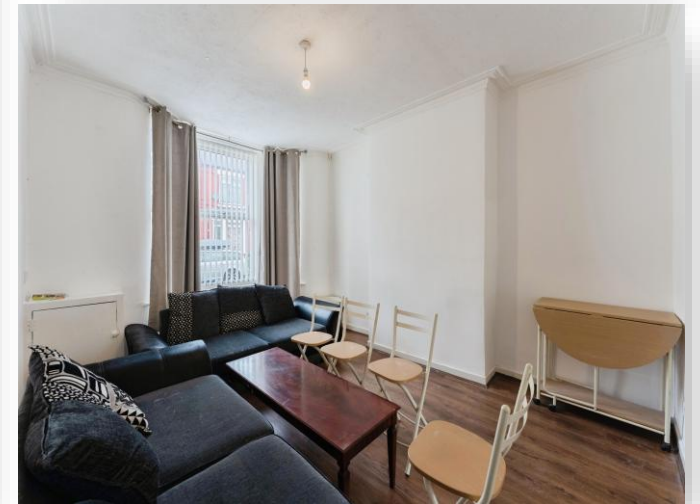
Wycliffe Street, Rock Ferry, Birkenhead, CH42 3YD