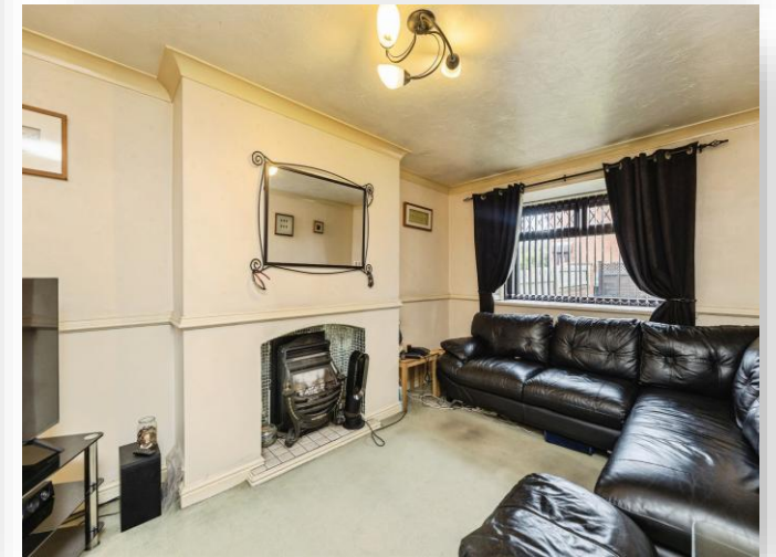
South Hill Way, Leeds LS10 4SE