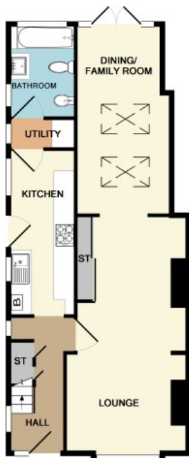
GROUND FLOOR APPROX. FLOOR AREA 573 SQ.FT. (53.2 SQ.M.)