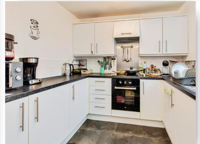
Samuel Place, Corby NN17 1BQ