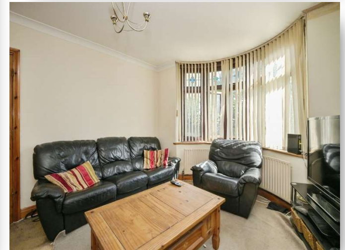
Park Road, Ware SG12 0AW