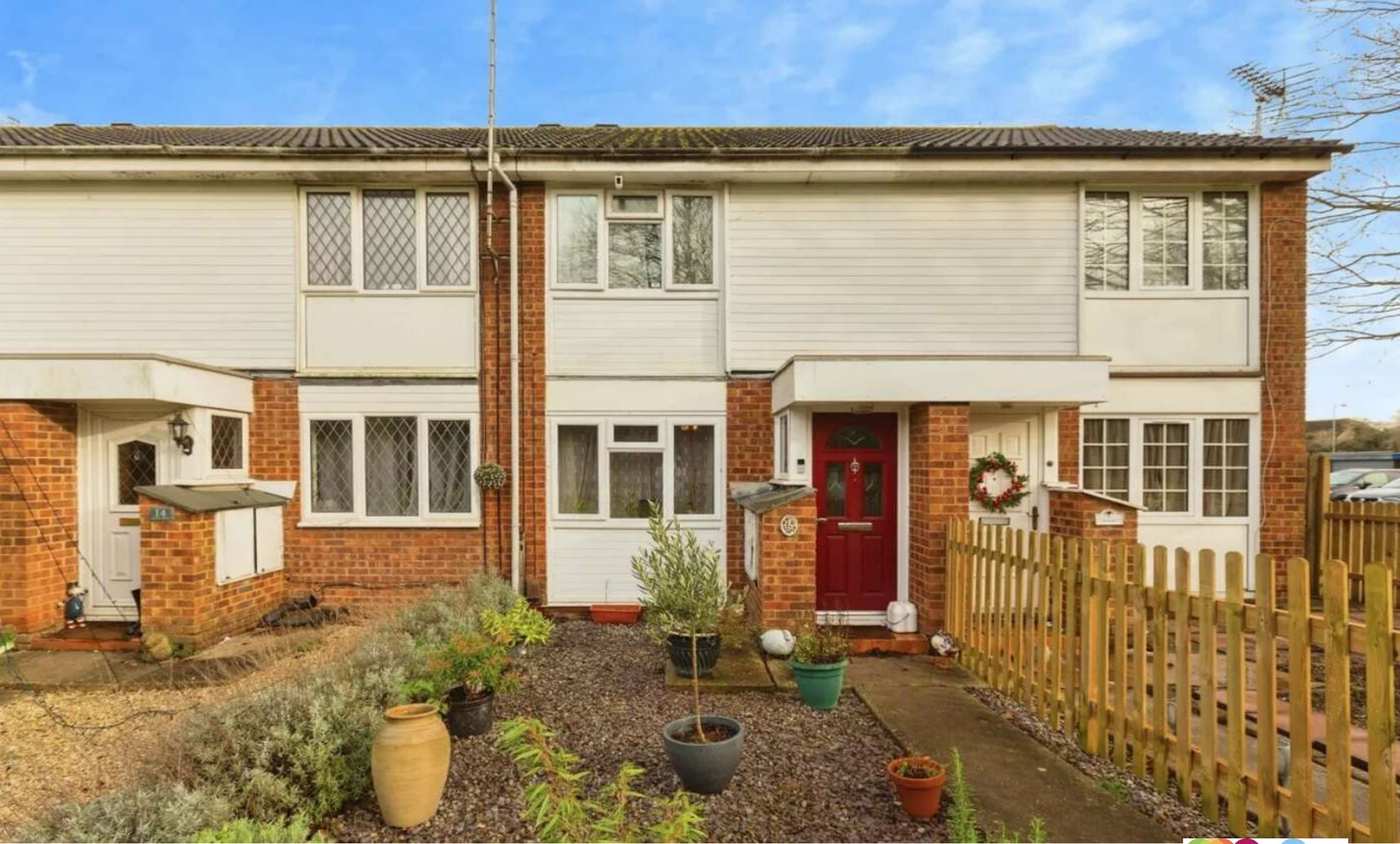
Lower Close, Aylesbury HP19 7SB