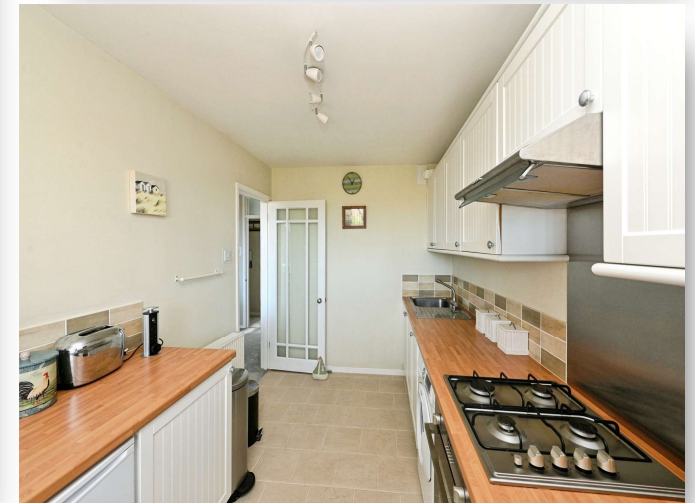
Buckingham Court, HUNSTANTON, PE36 6DA