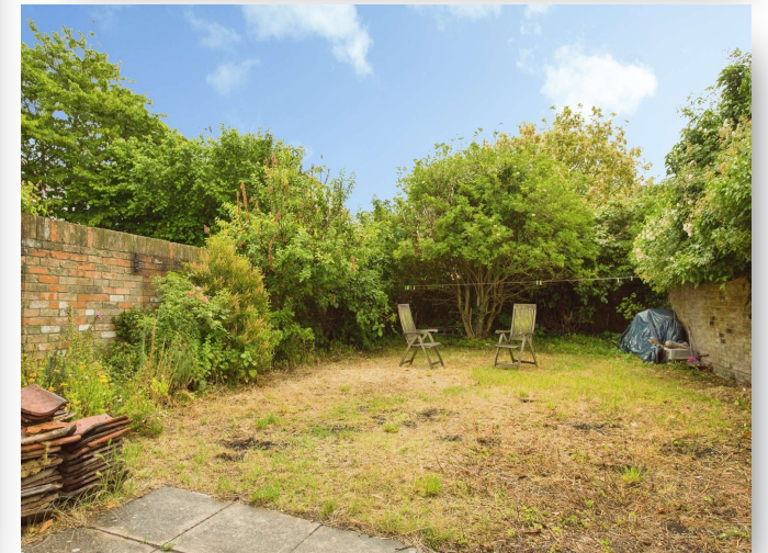
163 High Street, Cottenham, Cambridge, CB24 8RX