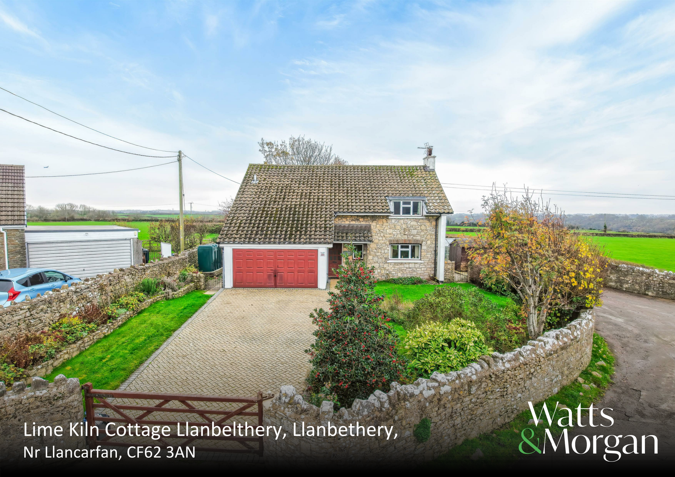
Lime Kiln Cottage Llanbelthery, Llanbethery, Nr Llancarfan, CF62 3AN