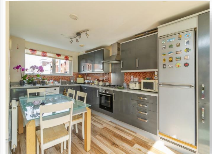
Addenbrookes Road, Newport Pagnell, MK16 9FD