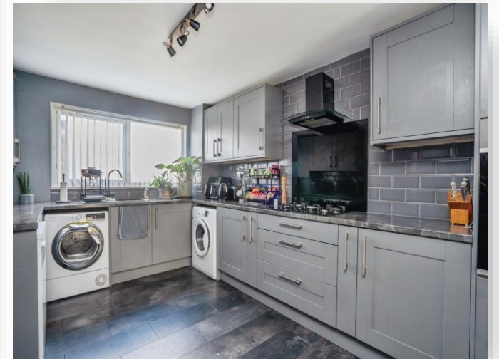
Athena Avenue, Waterlooville PO7 8AE