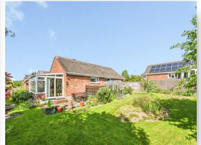
Meadow Road, Frome, BA11 2JE