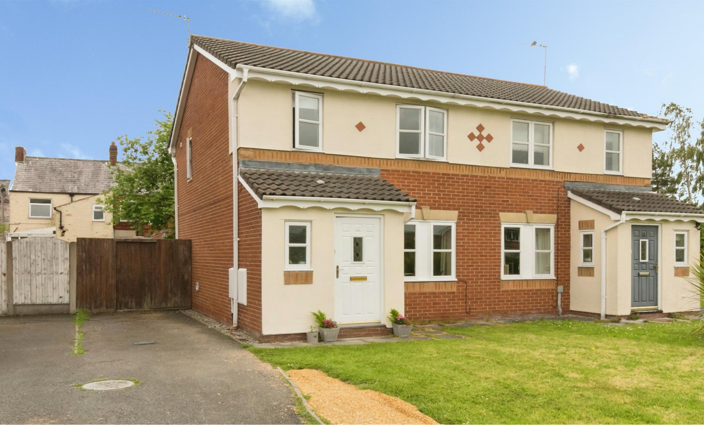
Firtree Close, Winsford CW7 3FS