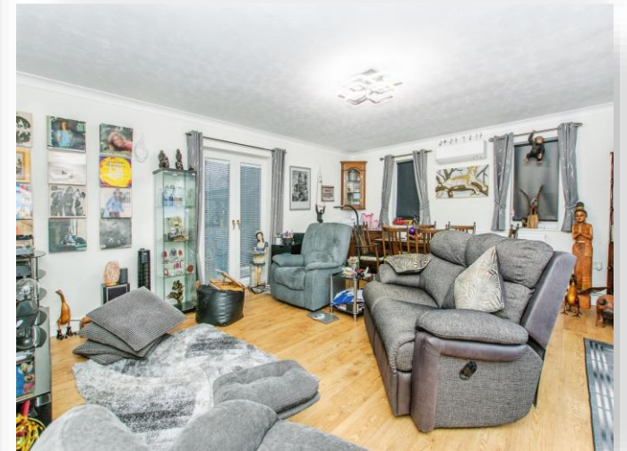
The Little Manor, Front Road, Murrow, WISBECH, PE13 4HU