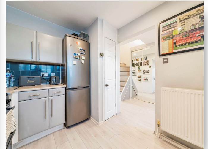
Chatham Court, Newark NG24 4BH