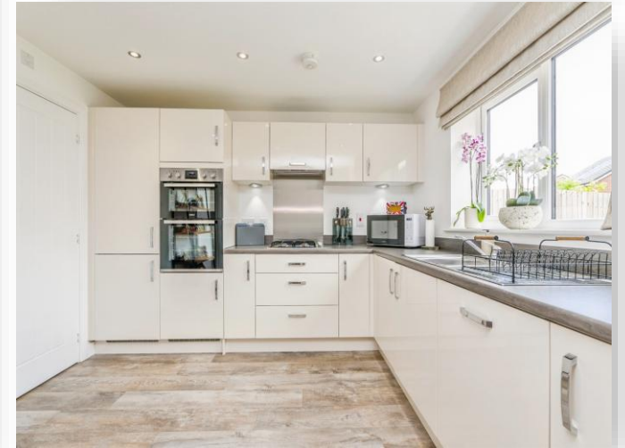
Melrose Walk, Sully, Penarth, CF64 5WD