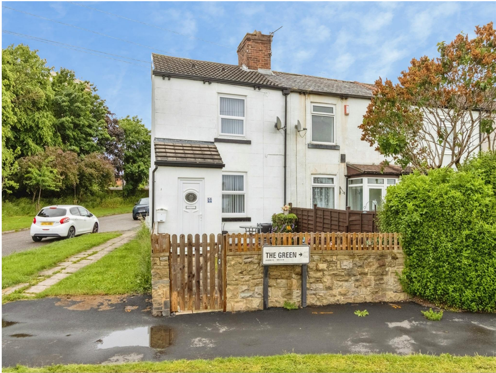
The Green, Seacroft Leeds LS14 6JW