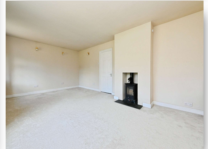
Hurst Crescent, Welney, Wisbech, PE14 9QJ