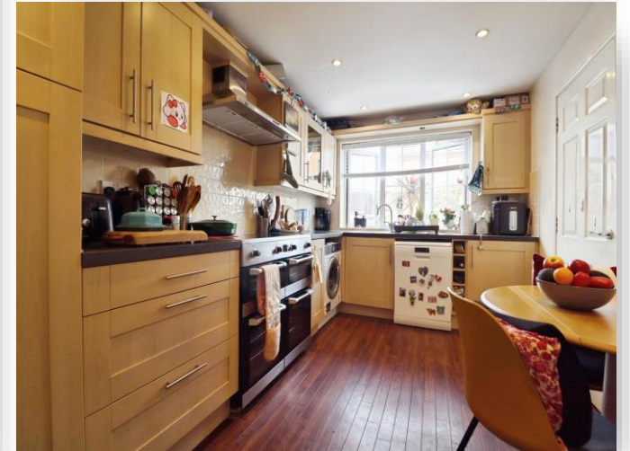
Clos Yr Wylan, BARRY CF62 5DB