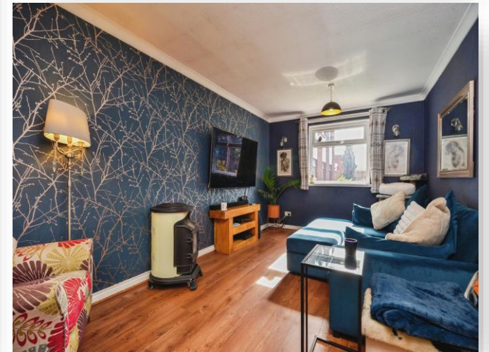
Alberta House Highfield Road, Middlesbrough TS4 2NP