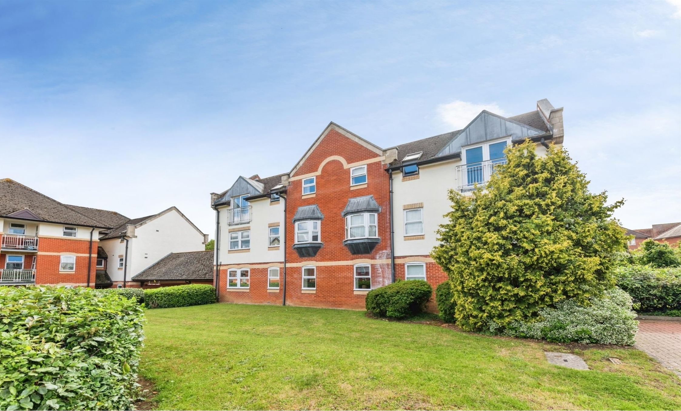
Jackman Close, Abingdon, OX14 3GA