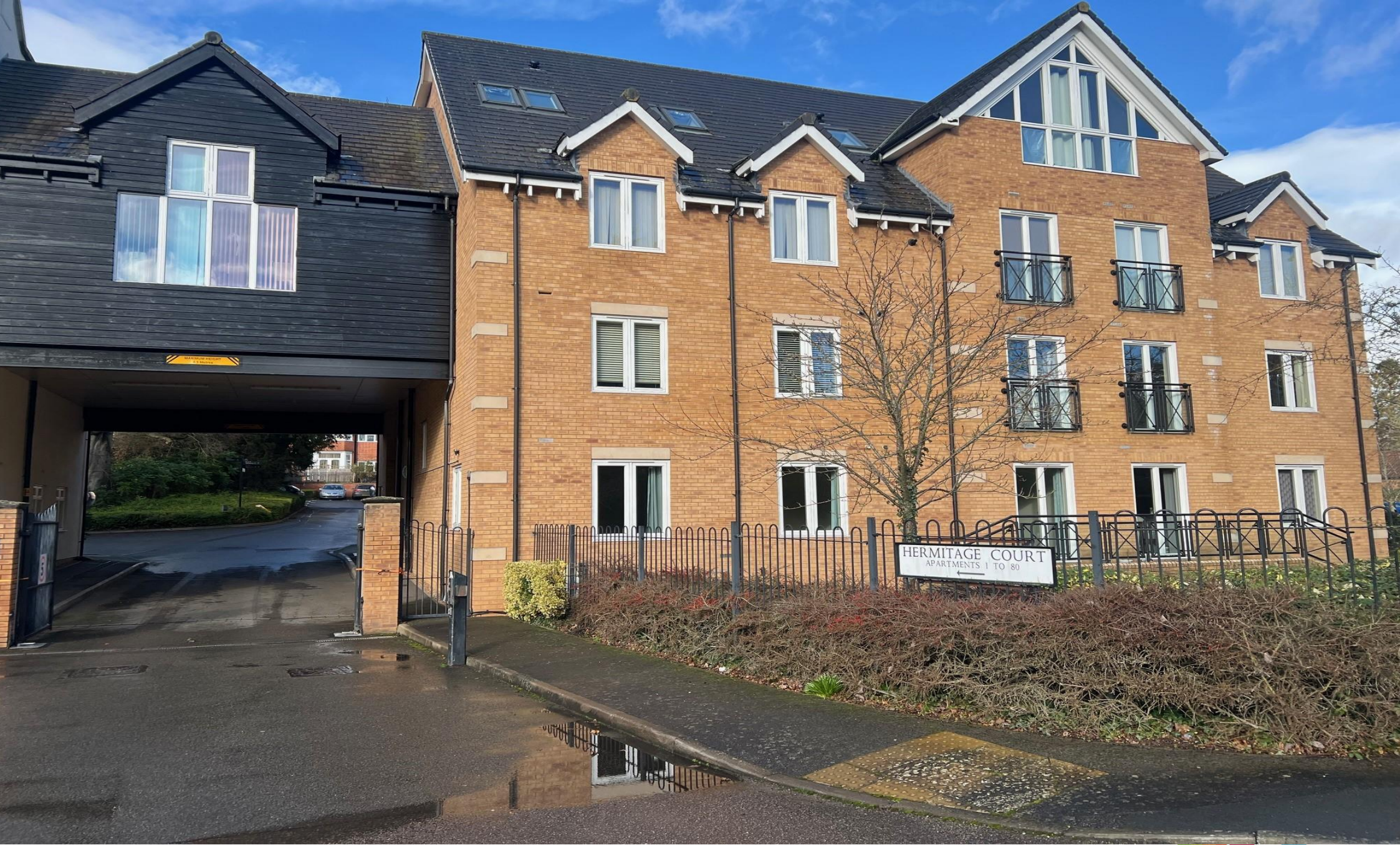
Hermitage Court Honeywell Close, Oadby Leicester LE2 5QQ