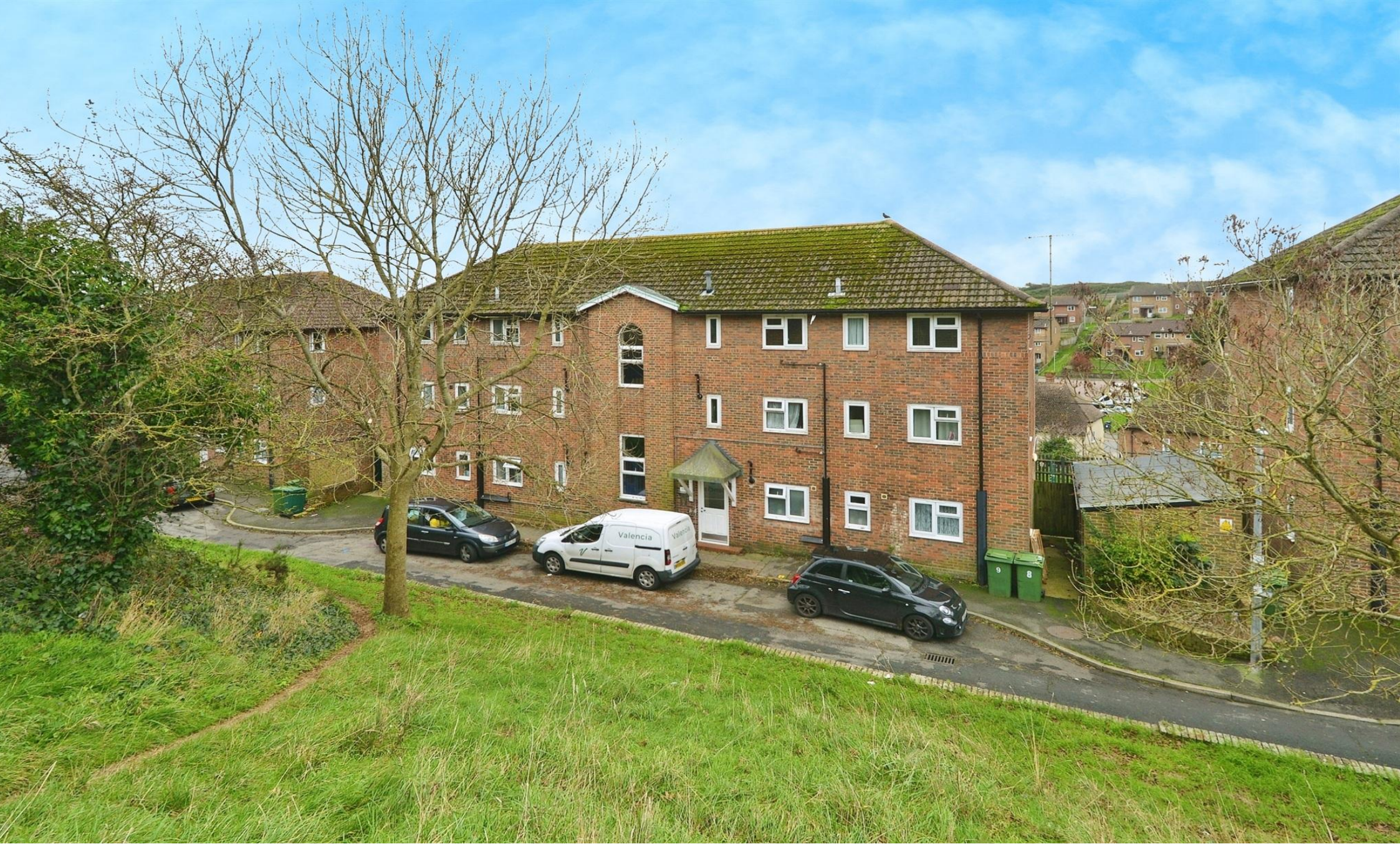
Hillcrest Court Hillcrest Road, Newhaven BN9 9EY