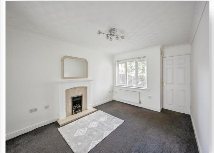
Loscoe Grove, Rotherham S63 9GH