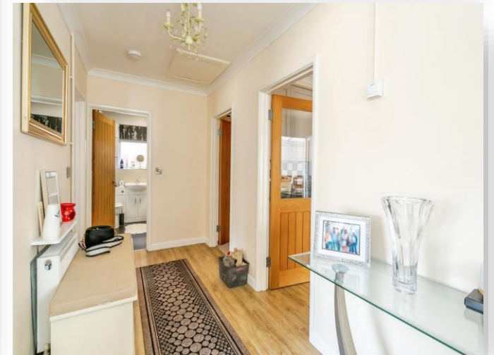
Robins Drive, Bognor Regis PO21 3BL