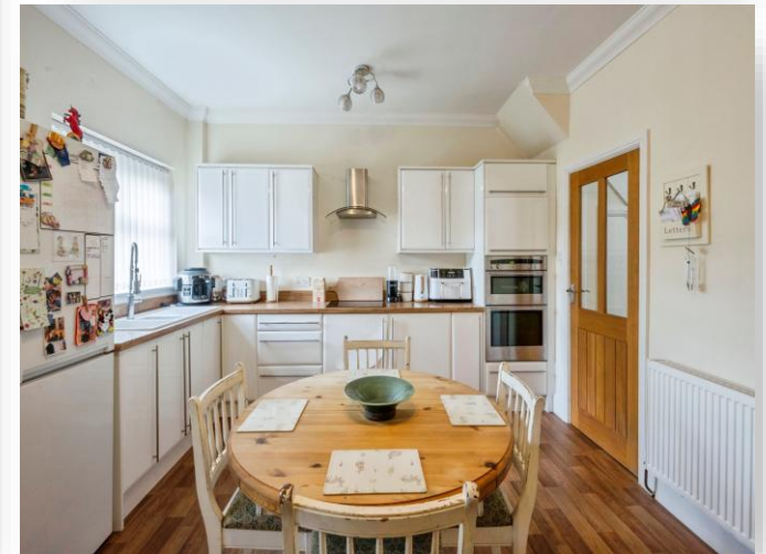
High Street, Thurnscoe Rotherham S63 0SY