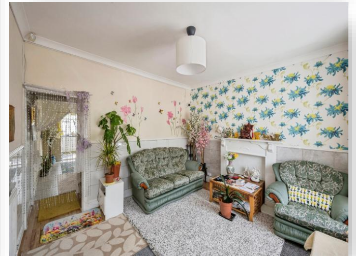
Sandymount Road, Wath-upon-Deerne Rotherham S63 7AD