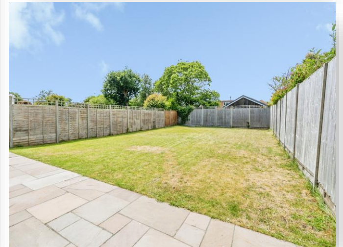
The Layne, Bognor Regis PO22 6JL