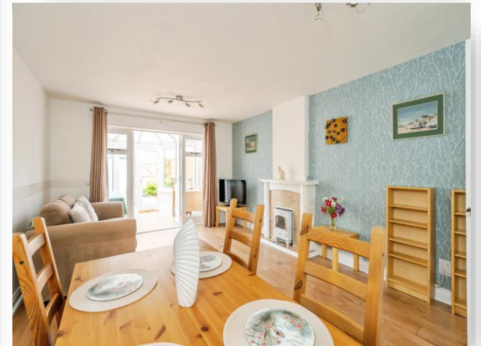
Northcliffe Road, Bognor Regis PO22 8BA