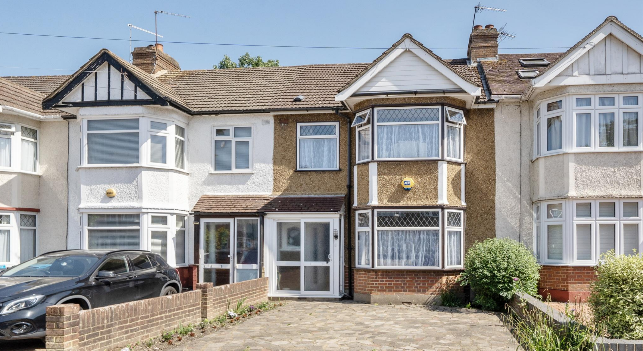
Ladysmith Road, Enfield, EN1 3AG