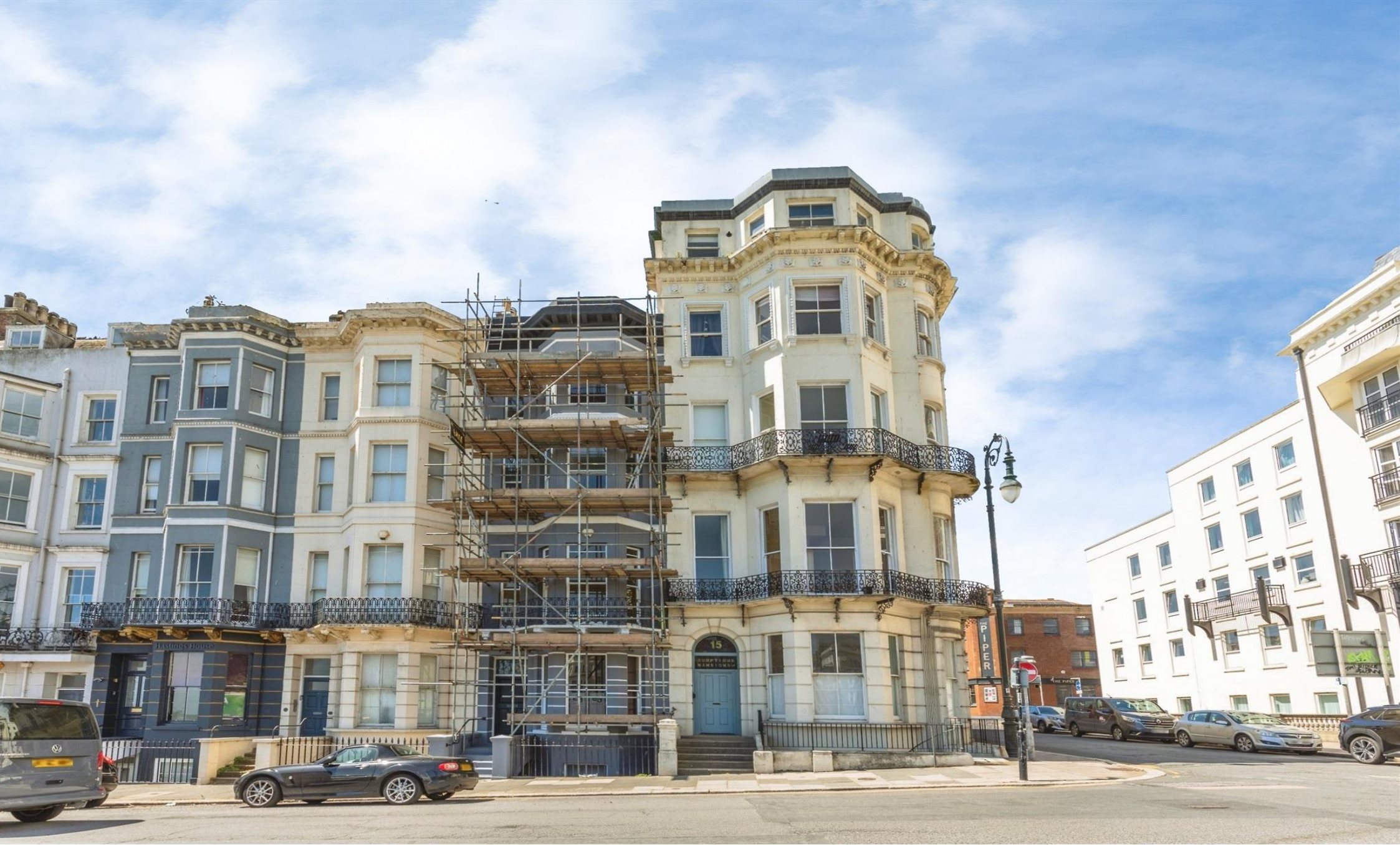
Bumptious Mansions Warrior Square, St. Leonards-On-Sea TN37 6BA