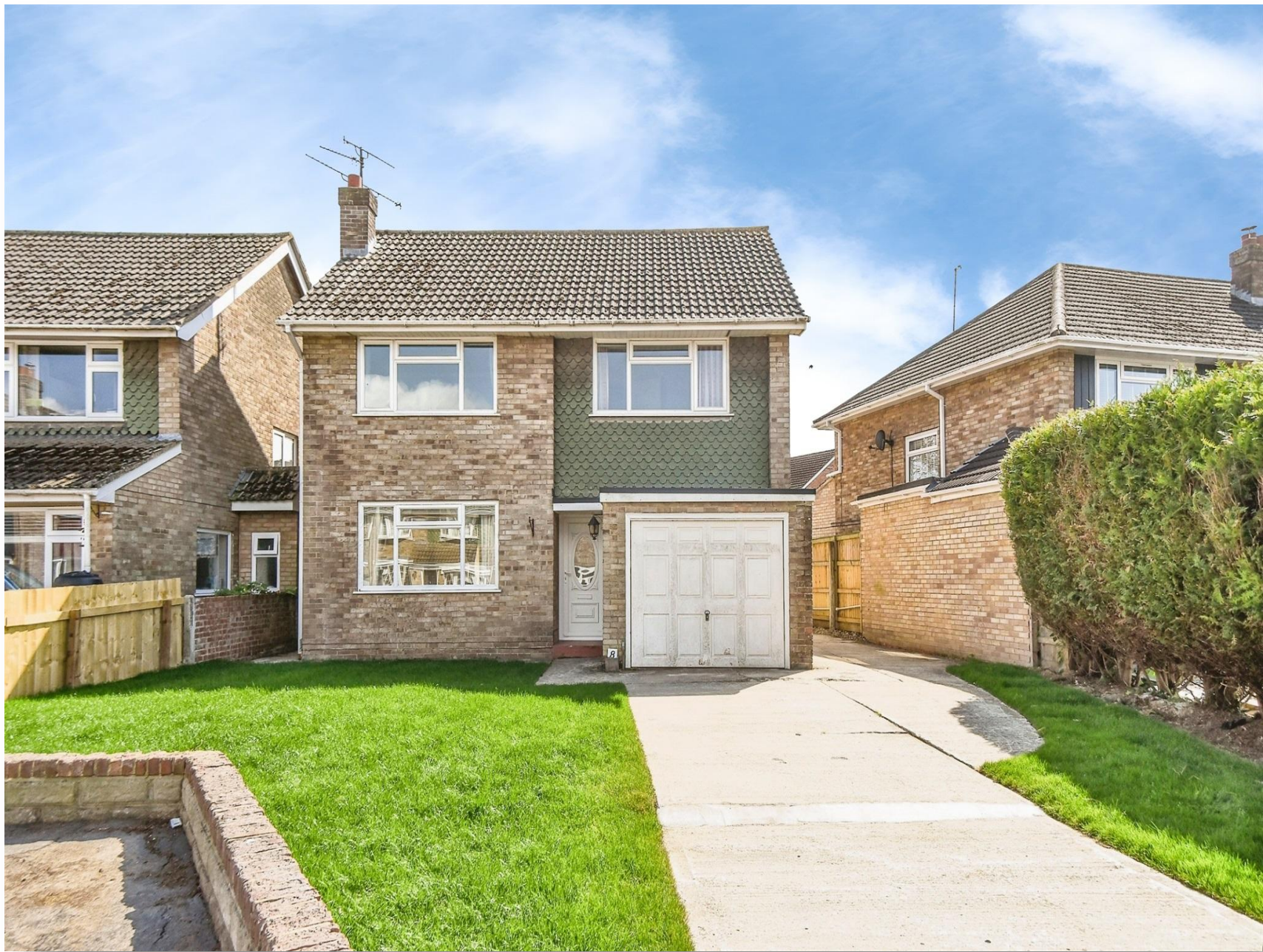
Frankton Gardens, Swindon SN3 4LU