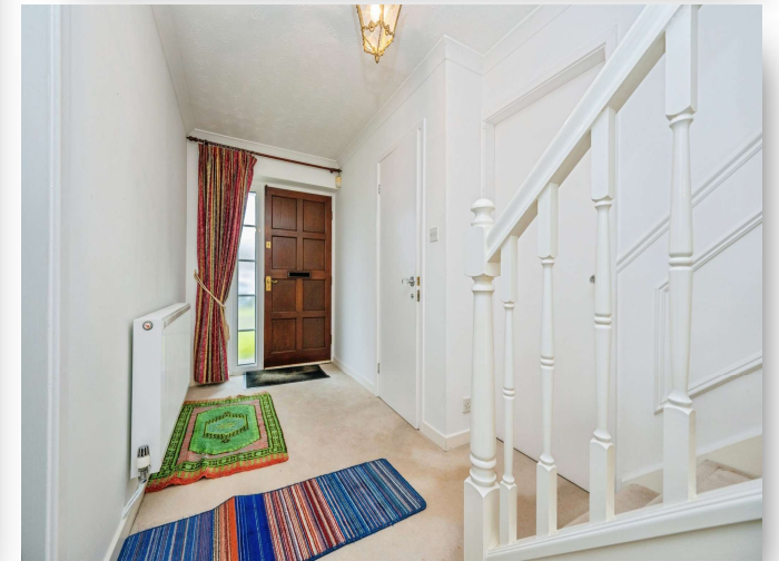
Hedingham Way, Mickleover Derby DE3 0NX