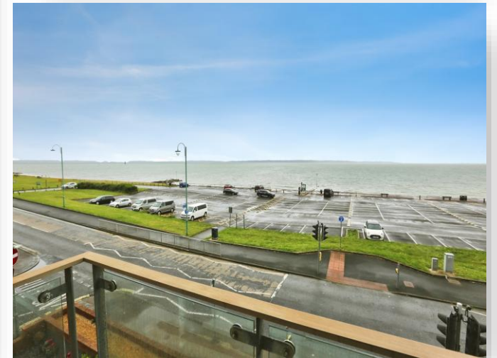
The Spinnakers Beach Road, Lee-On-The-Solent PO13 9FH