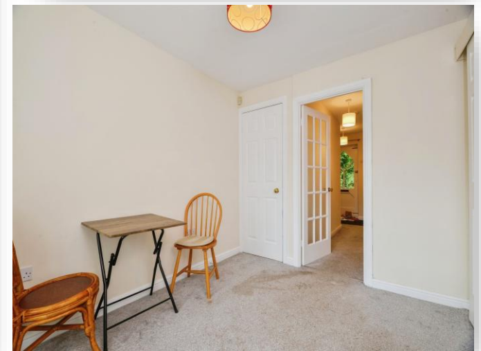
Anchorage Mews, Thornaby Stockton-On-Tees TS17 6BG