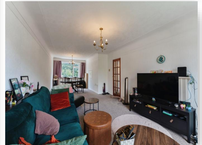
Talbot Court, Oxton, Prenton, CH43 6UD