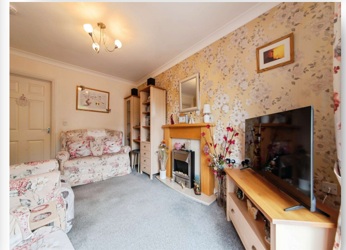
Hurn Close, Ruskington Sleaford NG34 9FE