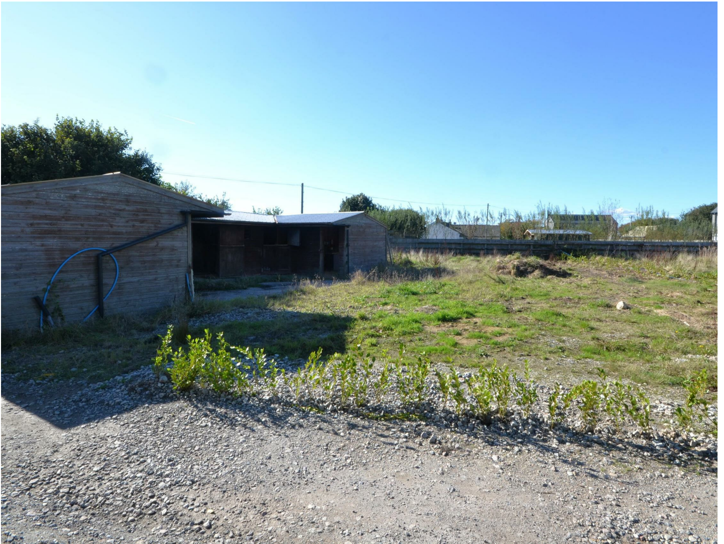
Building Plot at Trevenna Cross