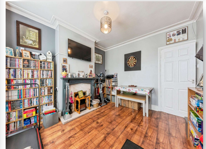
Sleaford Road, Newark NG24 1NG