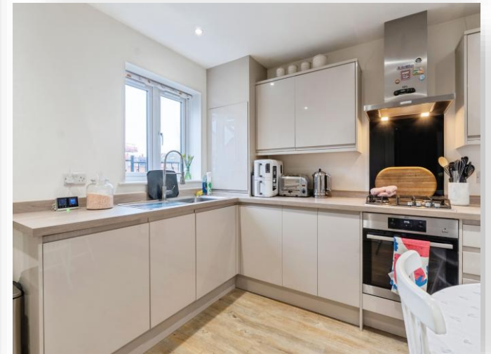
Windlass Close, Loughborough