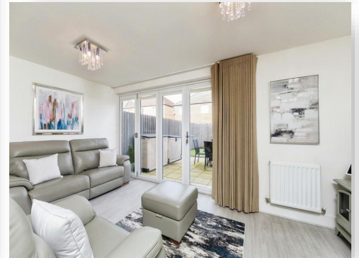
Green Shank Drive, Mexborough S64 0FH