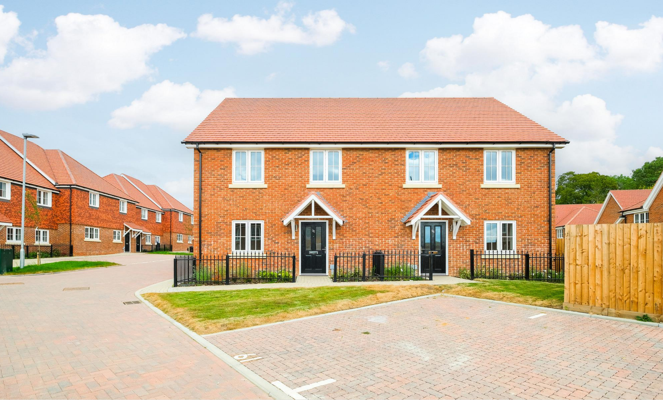
Plot 62 Hartley Acres, Cranbrook TN17 3LQ